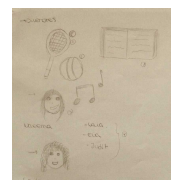
Figure 4. Sarah's drawing. Leisure context. What do you do with your friends?