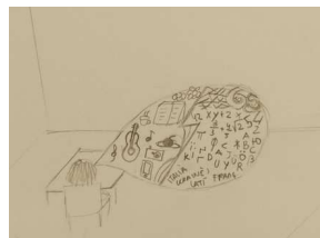
Figure 1. Maya's drawing. School context. How do you feel at school?