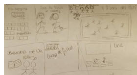
Figure 3. Mina's drawing. Leisure context. What do you do with your friends?